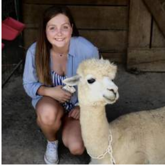
Abbey Holdinghausen Office Decorating & Window Painting