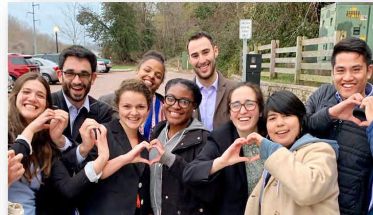
St. Louis CORO Fellows