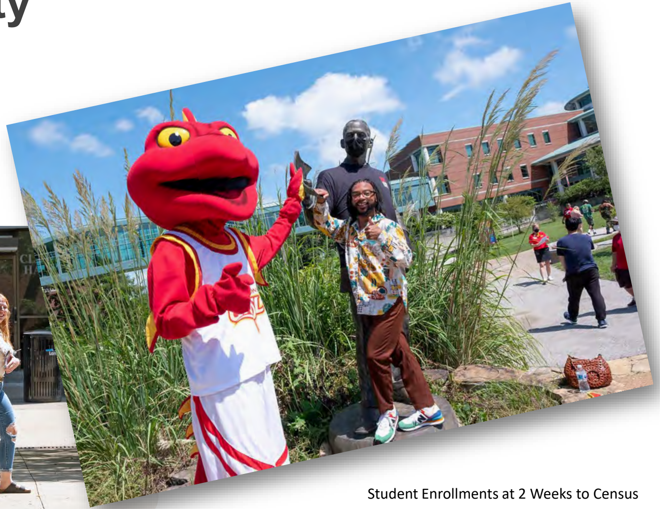
Student Enrollments at 2 Weeks to Census