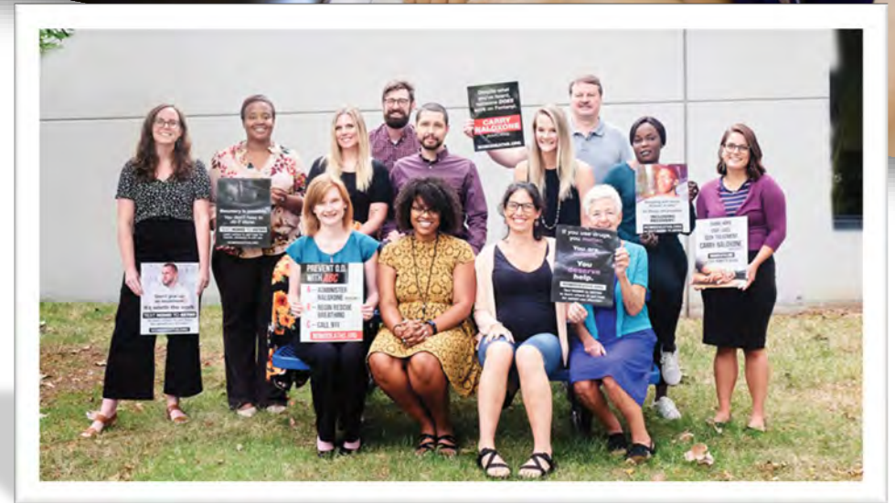
MIMH Addiction Science Team