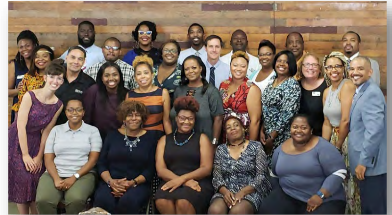
Neighborhood Leadership Fellows